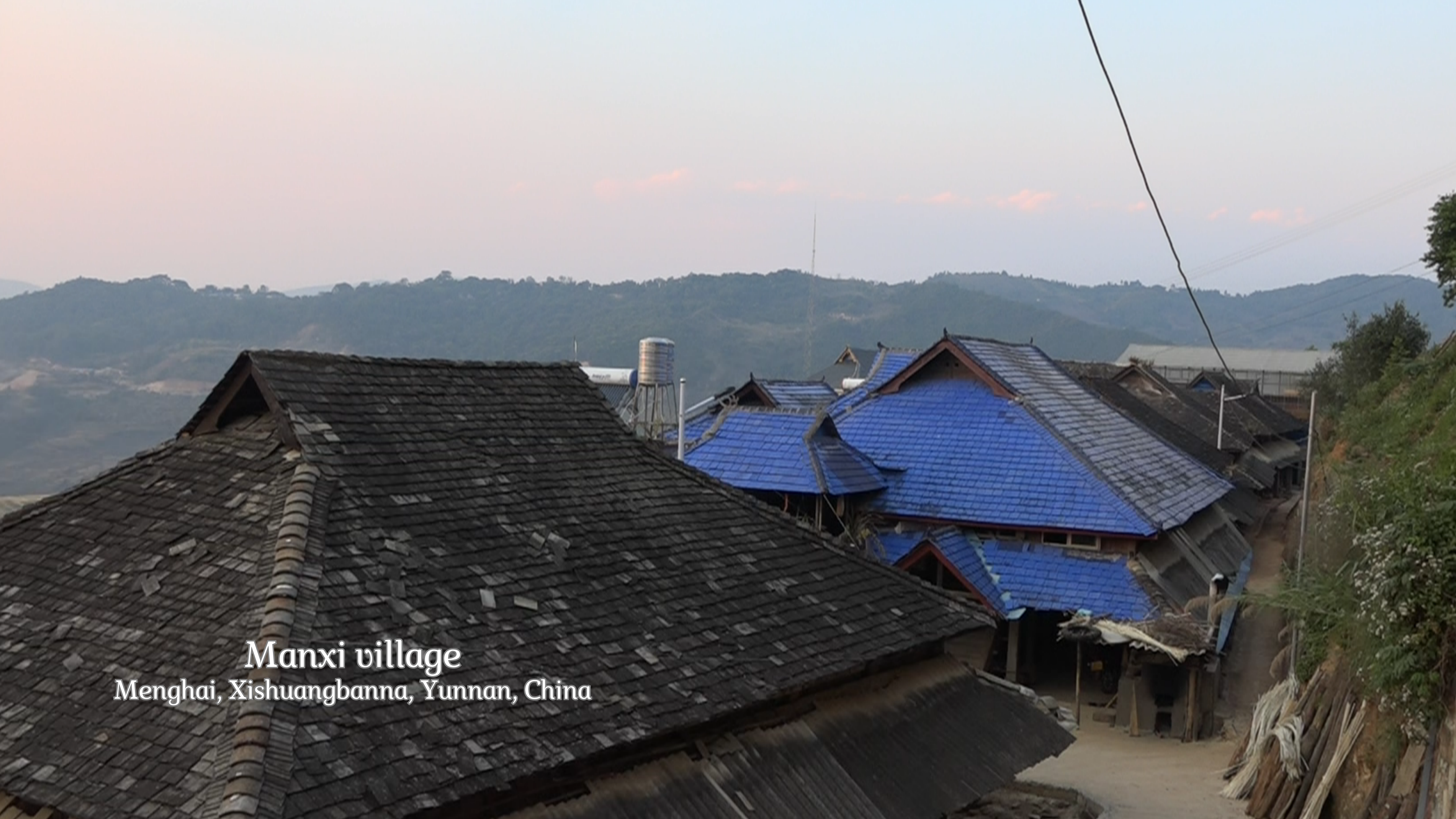
Manxi village Menghai, Xishuangbanna, Yunnan, China